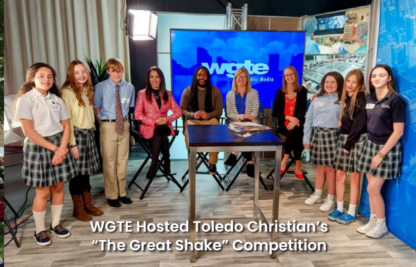
WGTE Hosted Toledo Christian's "The Great Shake" Competition