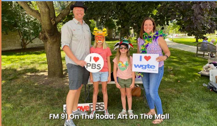
FM 91 On The Road: Art on The Mall