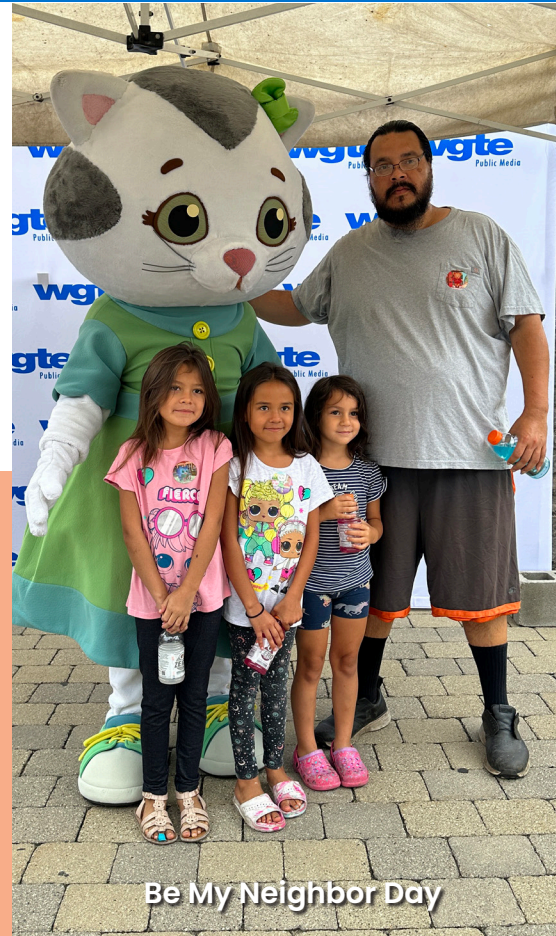
Be My Neighbor Day