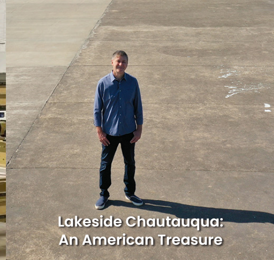
Lakeside Chautauqua: An American Treasure