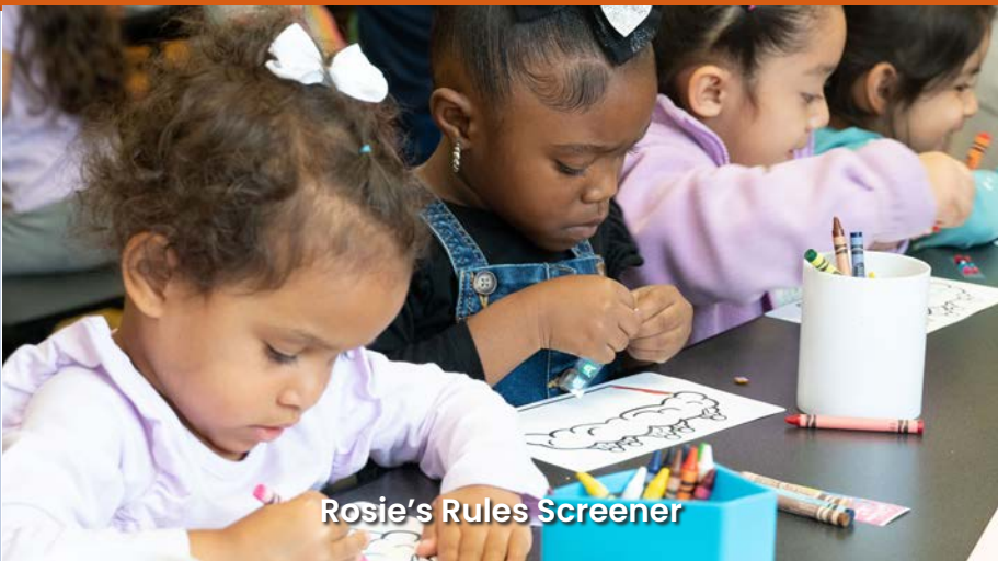
Rosie's Rules Screener