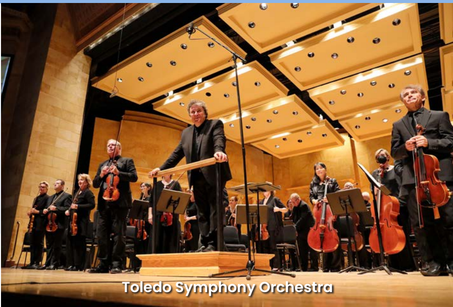
Toledo Symphony Orchestra

American Rescue Plan Act funds allocated by the City of Toledo and the Lucas County Commissioners and administered by The Arts Commission