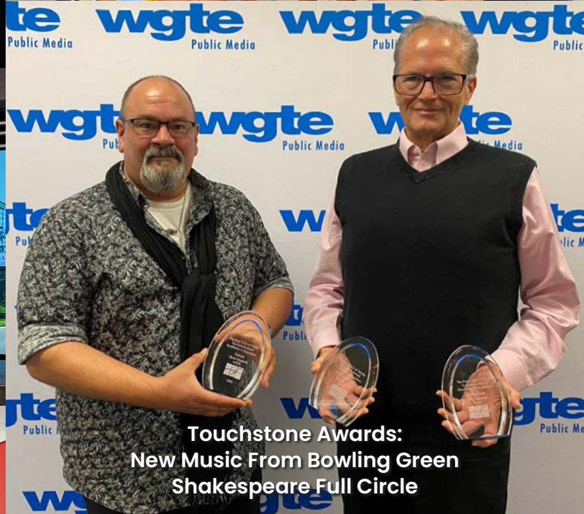
Touchstone Awards: New Music From Bowling Green Shakespeare Full Circle