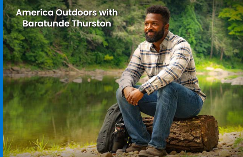
America Outdoors with Baratunde Thurston