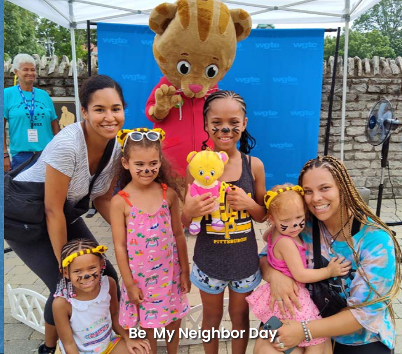
Be My Neighbor Day