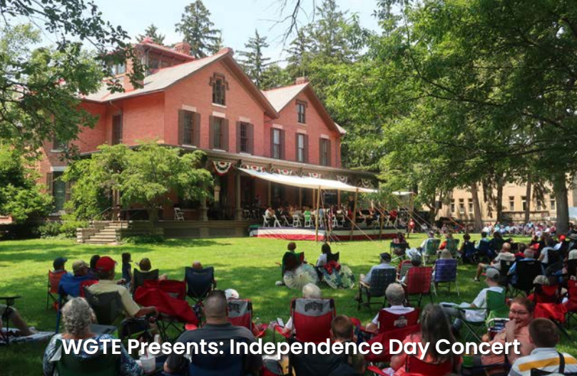
WGTE Presents: Independence Day Concert