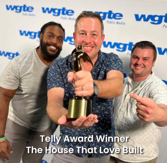
Telly Award Winner The House That Love Built