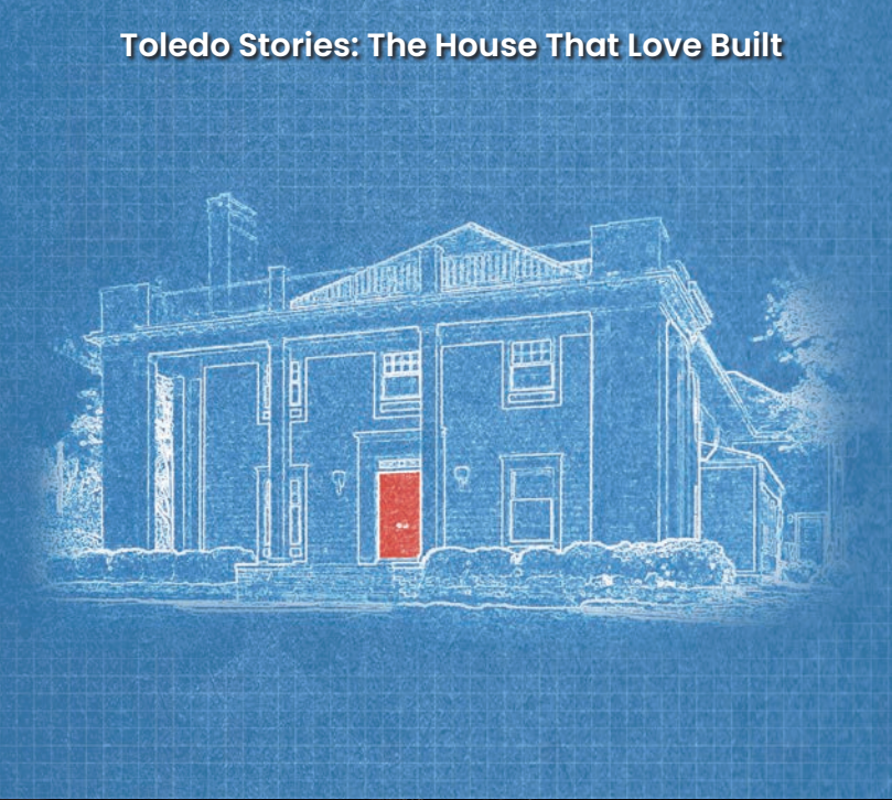
Toledo Stories: The House That Love Built