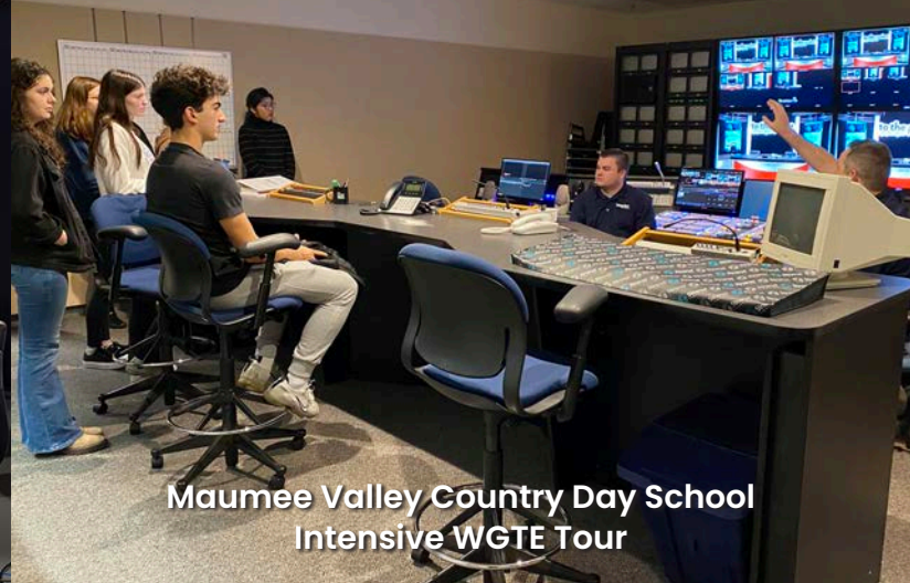
Maumee Valley Country Day School Intensive WGTE Tour