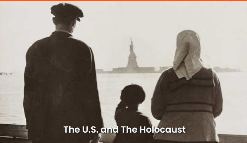
The U.S. and The Holocaust